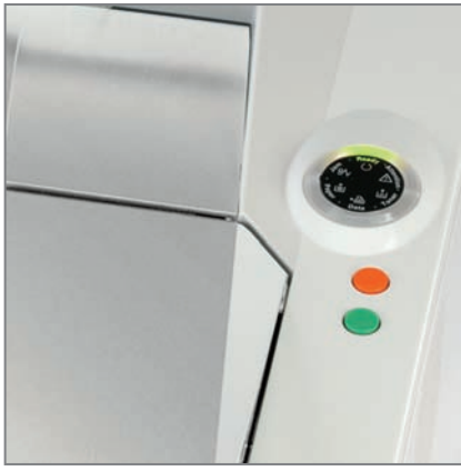
LED CONTROL panel for easy operation