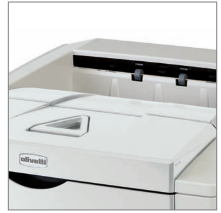
TIME TO FIRST PAGE of only 6 seconds